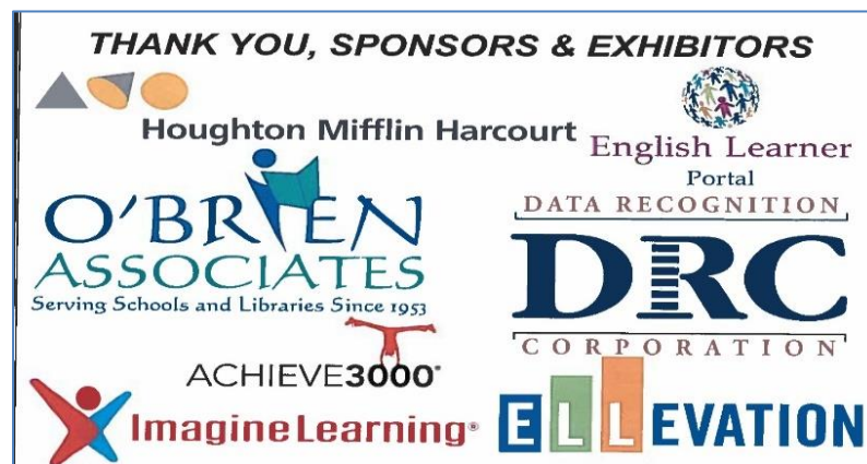
Sample logos from the 2019 Program